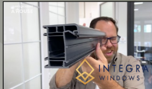
FEATURED IN EP 2-1