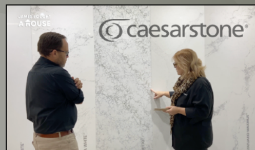
FEATURED IN EP 5-1