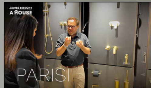
FEATURED IN EP 3-1