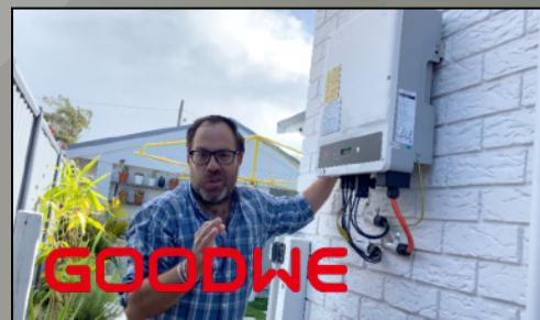
FEATURED IN EP 8-2