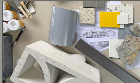
FEATURED IN EP 6-1