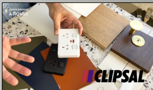
FEATURED IN EP 4-2