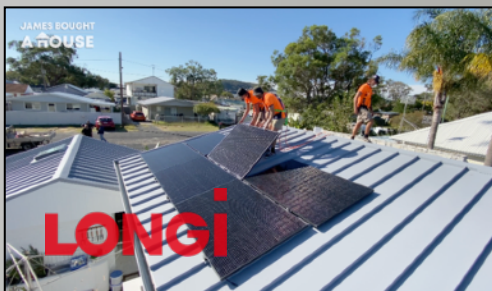
FEATURED IN EP 8-2