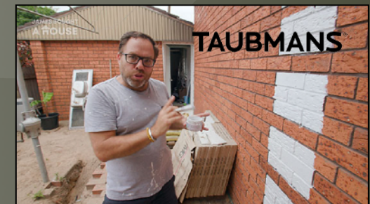
FEATURED IN EP 3-1