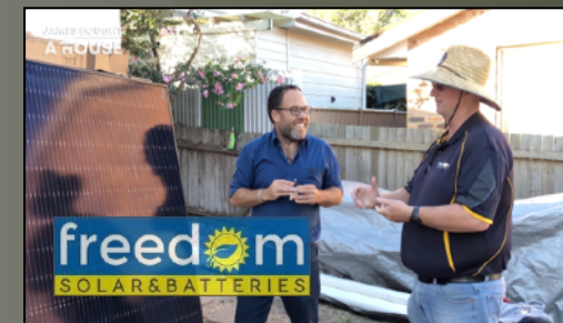
FEATURED IN EP 8-2