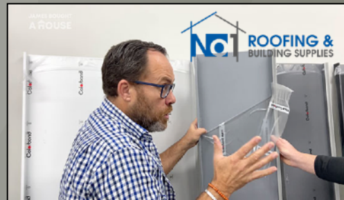
FEATURED IN EP 3-2