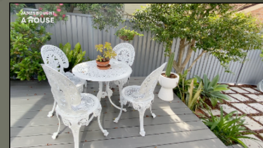
FEATURED THROUGHOUT THE SERIES