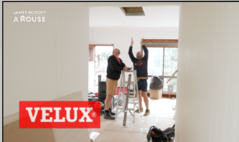
FEATURED IN EP 5-2