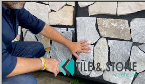
FEATURED IN EP 2-1