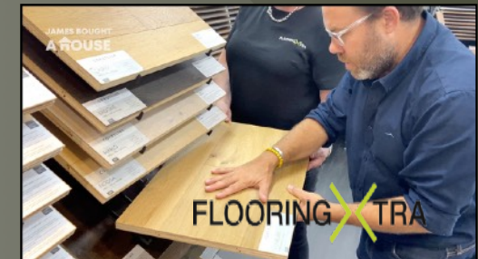
FEATURED IN EP 2-2