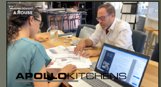
FEATURED IN EP 4-1