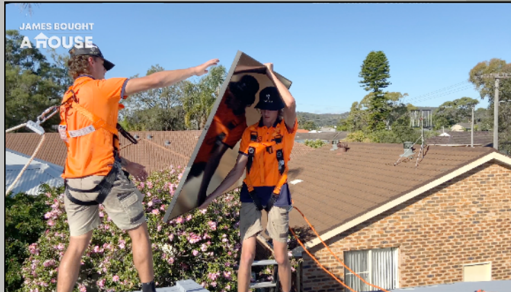
FEATURED IN EP 8-2