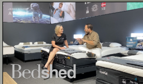
FEATURED IN EP 7-1