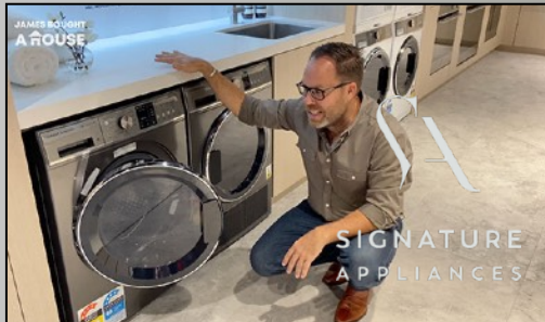
FEATURED IN EP 3-2