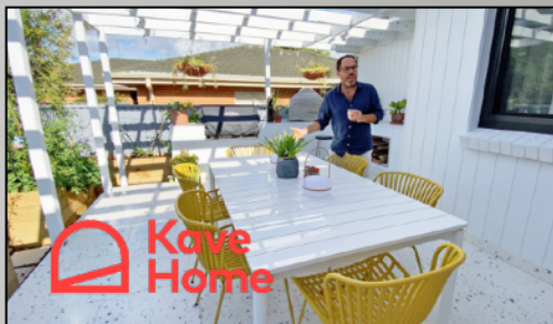
FEATURED IN EP 6-2